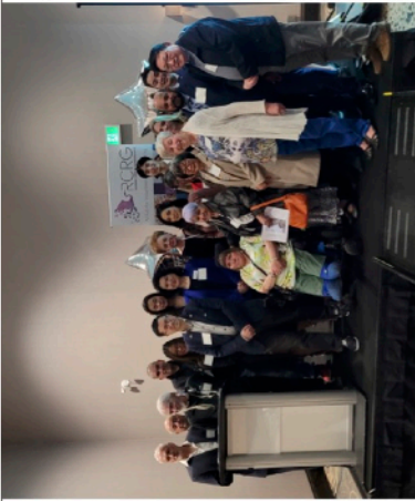
RASC participants and others at Volunteers are Stars awards ceremony

Richmond Advocacy & Support Committee (RASC) participants completed over 50 hours of skills development as well as 109 personal interviews during the Vision Zero Project