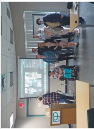
Participants in the June 2022 AGM, both in person and on Zoom