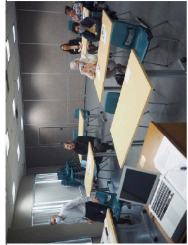
RPRC meeting during Covid times